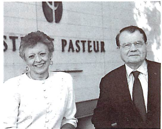
Two Pasteur scientists are awarded the Nobel Prize in Medicine for the discovery of the AIDS virus: Dr. Françoise Barré-Sinoussi and Dr. Luc Montagnier at the Institut Pasteur.

This news comes 25 years after the Pasteur team's groundbreaking discovery was published in Science on May 20, 1983. The Nobel Assembly noted in its announcement that "HIV has generated a novel pandemic. Never before